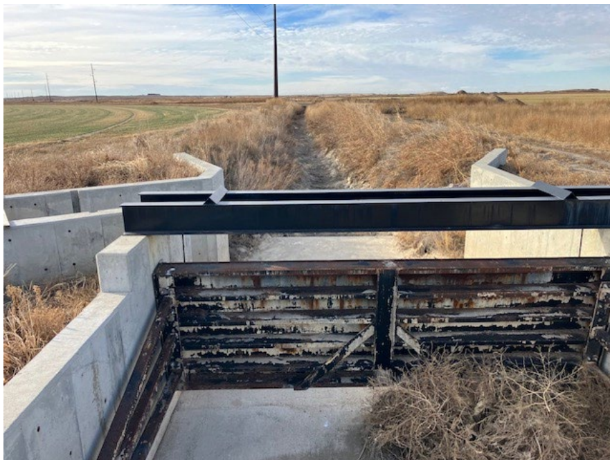
Figure 2. Current diversion works at Lateral C.